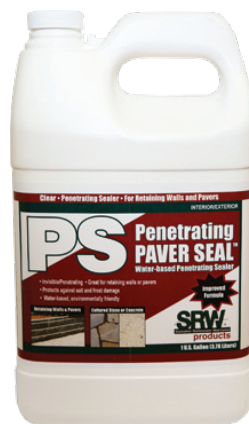
PS Penetrating Paver Seal

100-200 sq. ft. per gallon, exterior pavement coverage (based on an 1/8" joint spacing). Quantity may vary depending on surface and application.