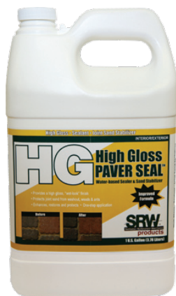
HG High Gloss Paver Seal

100-150 sq. ft. per gallon, exterior pavement coverage (based on an 1/8" joint spacing). Quantity may vary depending on surface and application.