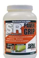
SR Paver Grip 5 gallons Paver Seal™ use 1 lb. of Paver Grip™ 1 gallon Paver Seal™ use 1 cup of Paver Grip™

200-300 sq. ft. per gallon when diluted.