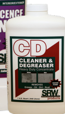
Cleaner & Degreaser

100-150 sq. ft. per gallon. Quantity may vary depending on surface and application.