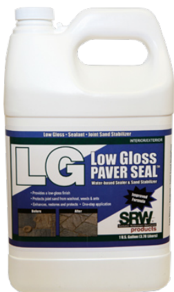
LG Low Gloss Paver Seal

100-150 sq. ft. per gallon, exterior pavement coverage (based on an 1/8" joint spacing). Quantity may vary depending on surface and application.